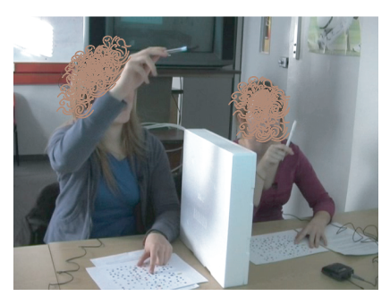
Figure 3. Two participants at work in the pilot of the experiment.