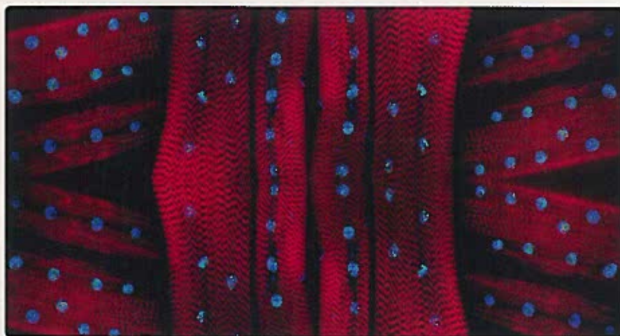
Nuclear gems dotting the multinucleated larval muscles of Drosophila melanogaster . Body wall muscles of fruit fly larvae constitutively expressing fluorescently tagged Gemin3 stained for GFP (green), actin (red), and DNA (blue). Multiple image slices obtained using the Zeiss LSM 510 META confocal microscope were used to generate a maximum intensity projection. Credit: Ruben J. Cauchi, Department of Physiology & Biochemistry, University of Malta, Malta. Design by Yusef Ramelize.