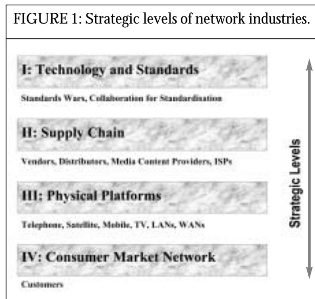
FIGURE 1: Strategic levels of network industries.

Much of the popular discussion of technology and its effects makes powerful but general claims for the effect of technology but is less than clear about the underlying mechanisms. We observe four nested levels of infrastructure within network industries. Each of these levels has its own economic dynamics and each makes a contribution to the overall network (increasing returns characteristic). These levels are (i) technology standards, (ii) the supply chain driven by such standards, (iii) the physical platforms that are the output of the supply chains and are the basis from which the company delivers its product (e.g. the digital TV, the decoder, the satellite system, and the telephone lines that are the platform from which Sky TV delivers its programmes), and (iv) the consumer network (Figure 1). The economic characteristics of the first three levels are the prevalence of fixed costs and joint products coupled within economies of scale. Networks of interacting and interdependent customers provide the increasing returns characteristic